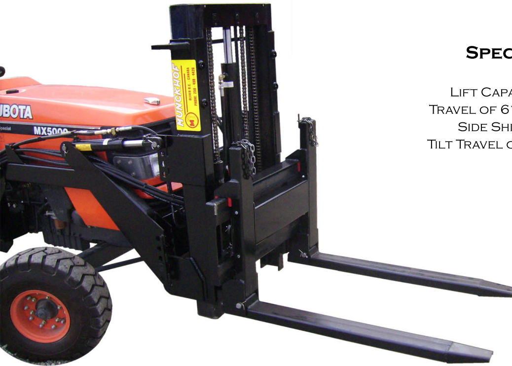
( 72 in Loader )